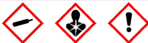
GHS04 GHS08 GHS07